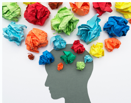
click on the photo above