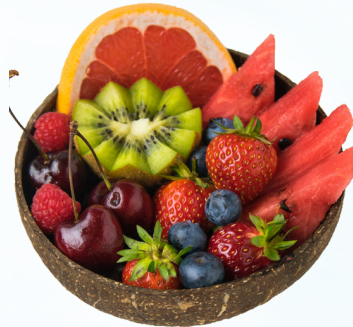
click on the photo above

Eating well is important for good growth and development.