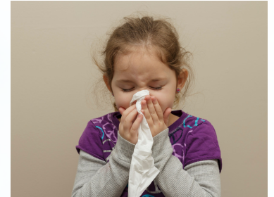
click on the photo above

Allergies are very common and are thought to affect more than 1 in 4 people in the UK. They're particularly common in children.