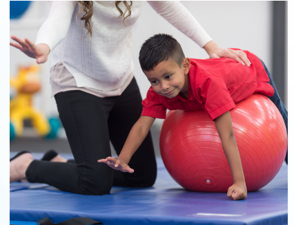
click on the photo above

Exercise and physical activity is a core part of development for children.