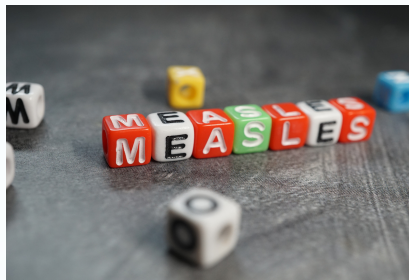
click on the photo above

In light of recent increases in measles cases across the country, it is important that parents/carers ensure that their children receive both doses of the MMR vaccination.